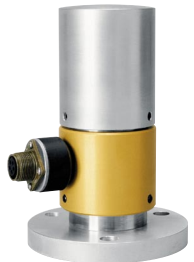
SGMC Includes cap and base.

See back page & Dillon Load Cells specifications sheet for more dimensions and detail