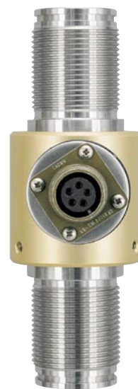
SGMT Designed for overhead suspension. Optional eye nut available.