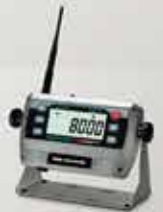
MSI-8000 HD RF Remote Display